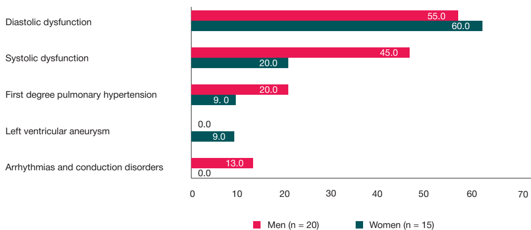
Fig. 3. The incidence of myocardial infarction complications in young adults (<45 years). The proportion of patients with at least one complication type is shown, %

and mortality caused by MI among them is increasing [2, 8]. A number of studies have shown that women with MI receive therapy later than men [34-37]. Kaur et al. [37] reported that the average time elapsed from the onset of MI symptoms to the moment the patient finally visited the doctor was 53.7 and 15.6 h for women and men, respectively. Our data were different: 9.2 \pm 2.4 and 4.3 \pm 2.1 h, respectively ( p < 0.05 ).