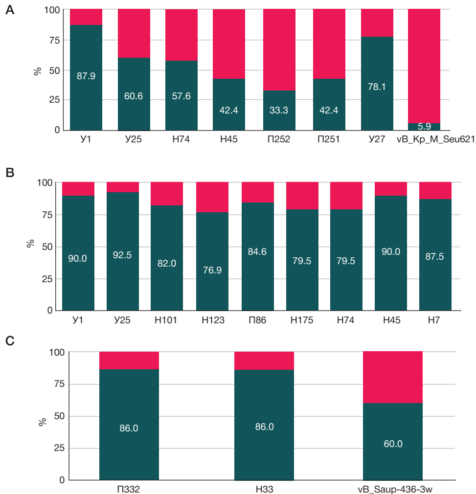
Fig. 3. The efficacy of commercial phage products against K. pneumoniae (A), P. aeruginosa (B) and S. aureus (C). The green shows the proportion of strains sensitive to the tested phage products. Batch numbers represent the tested products: "Purified polyvalent pyobacteriophage" (U1, U25); "Complex pyobacteriophage" (N74, N45); "Klebsiella pneumoniae purified bacteriophage" (P252, P251); "Klebsiella pneumoniae purified polyvalent bacteriophage" (U27); "Pseudomonas aeruginosa bacteriophage" (N7); "Staphylococcal bacteriophage" (P332, N33).

available bacteriophage against E. faecium ; it successfully infected 24 (4.2%) E. faecium strains.